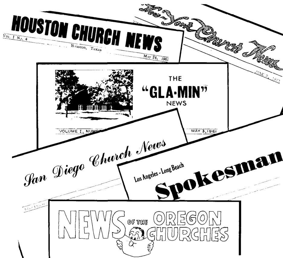
Mastheads of several of the local church papers.

The first newspaper on the stack is entitled "NEWS OF THE OREGON CHURCHES." You guessed it — it's partly illustrated by Mr. Basil Wolverton! Right under the headline is a little cartoon — drawn by Basil Wolverton — of a very interested reader with a newspaper in his hand, drawn so close to his face in profound interest that his nose has poked a hole through the paper! We find on the editorial staff of this Oregon