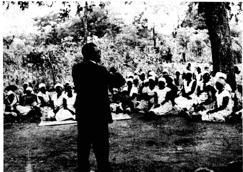
Service conducted at Kasenga's Village on May 7.