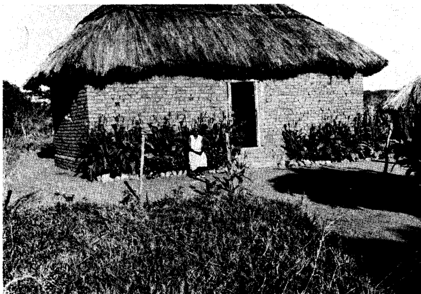
One of the teachers' houses at Mwambula's Village.