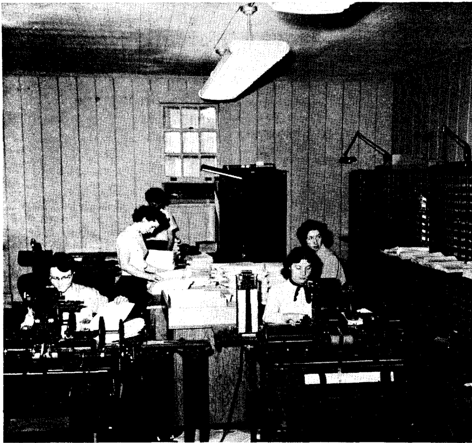
Ambassador College Press Mailing Department as it was in the years of 1948 through 1956.