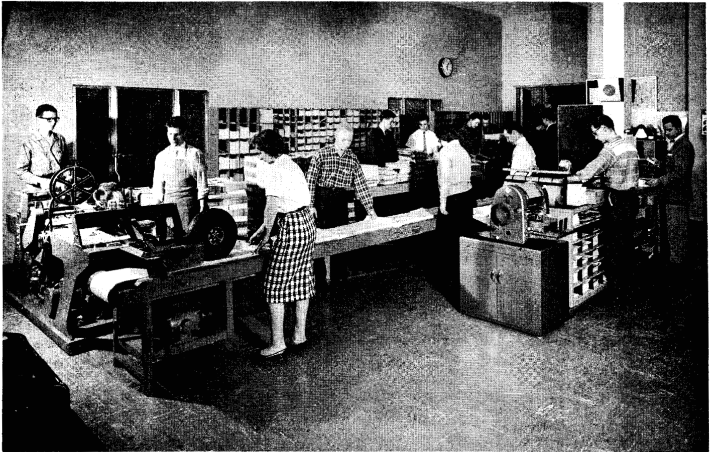
Ambassador College Press Mailing Department as it is today — 1961 — showing part of our new IBM electronic system.